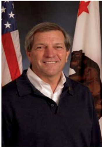
Senator Mark DeSaulnier Seventh Senate District

It is my honor to work with the California Senior Legislature.