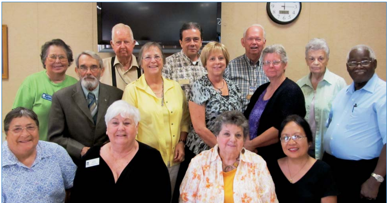
KERN COUNTY COMMISSION ON AGING PSA 33