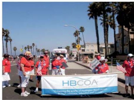
Supporting and Promoting Active Aging

HBCOA raises funds to provide vital support services to older adults in Huntington Beach.