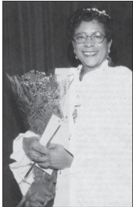
MS SENIOR LYNWOOD