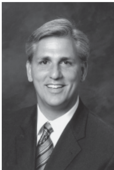
KEVIN McCARTHY ASSEMBLY REPUBLICAN LEADER

Thank you California Senior Legislature for your hard work on behalf of California's Seniors. Best wishes for a successful convention.