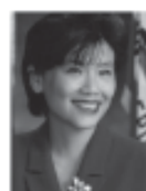
Assemblywoman Judy Chu