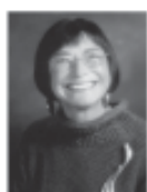
Assemblywoman Patty Berg