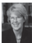
Senator Dede Alpert