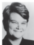
Senator Sheila Kuehl