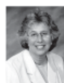
Assemblywoman Lois Wolk