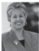
Assemblywoman Gloria Negrete McLeod