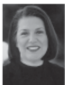
Assemblywoman Sarah Reyes