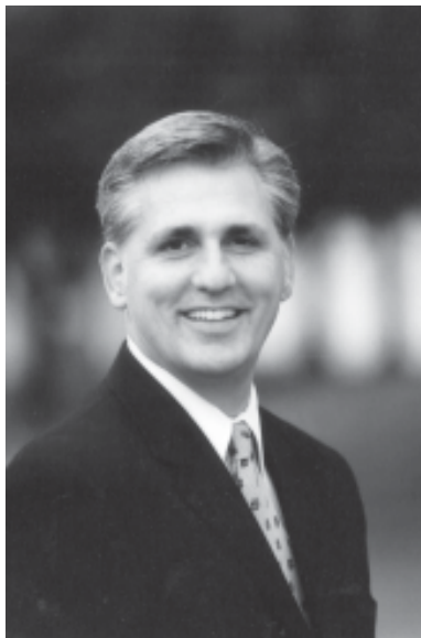
KEVIN McCARTHY ASSEMBLYMAN, 32 ND DISTRICT

Congratulations and Best Wishes for a Successful Convention! I appreciate the time and energy devoted to this worthwhile cause by everyone involved in order to preserve the quality of life for older Californians.