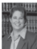
Senator Denise Ducheny