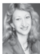
Senator Debra Bowen