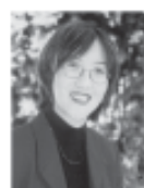
Assemblywoman Wilma Chan