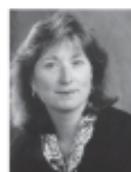
Assemblywoman Ellen Corbett