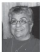
Senator Nell Soto