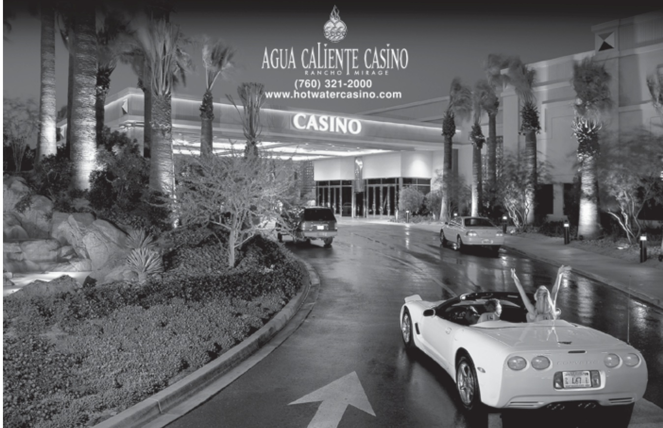
Bob Hope and Ramon at the I-10 in Rancho Mirage

Come play in the stylish luxury that is Agua Caliente Agua Caliente Casino offers 1,000 of your favorite slot games, over 40 table games, poker and bingo Fine and casual dining and live entertainment nightly Open 24 hours