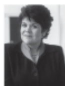
Senator Martha Escutia