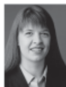
Assemblywoman Sally Lieber