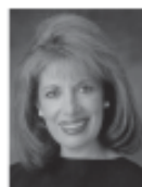
Senator Jackie Speier