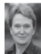
Assemblywoman Loni Hancock