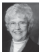
Senator Betty Karnette